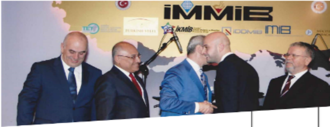
Çakıroğlu Metal, 2013 yılında bir DEİK kuruluşa olan İMMİB'nin "En İyi İhracatçı Ödülüne" layık görüldü. Çakıroğlu Metal was awarded by İMMİB, one of the DEİK establishments in 2013 and won the best export award called "Export Stars Award".